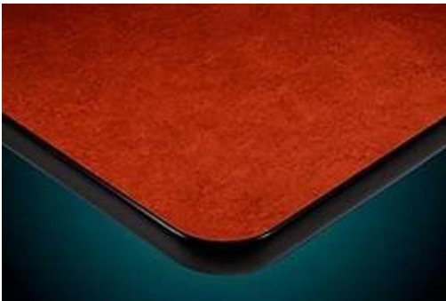
Laminate with Vinyl "T" Mold Edge