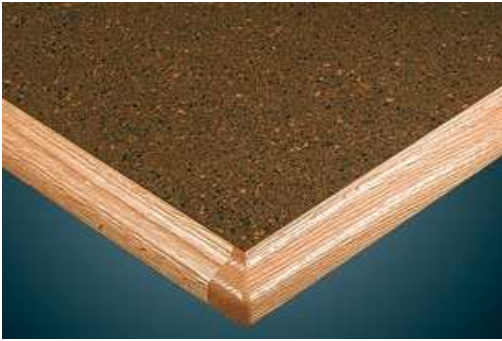
Laminate with Internal Wood Edge