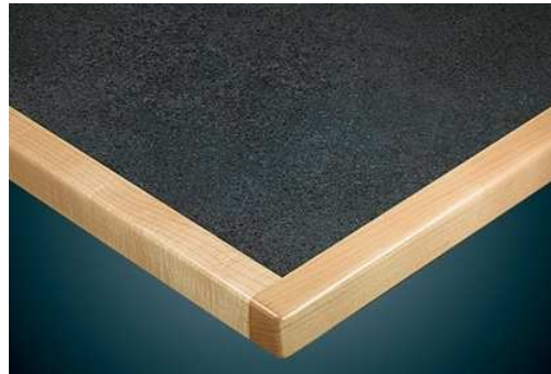
Laminate with External Wood Edge